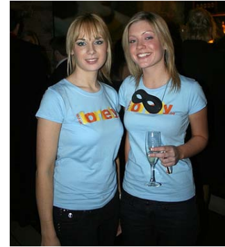
Models, Promotional Personnel