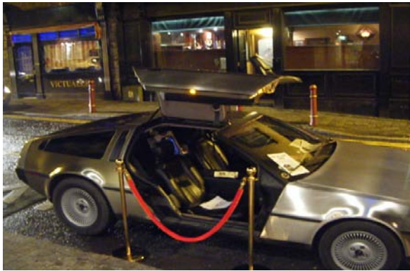
Delorean outside an 80's night

Our second theme event "If you were born in the 80's" on the 4th July, was a blast from the past, transporting 80's music, Sweets, Giant twister, Rubix cube, Pacman & oh yes the Slow Dance into Velvet for one special night. Best fancy dressed guests won Two Mobile Phones, while those who participated in the games won DVD's, CD's & Vouchers.